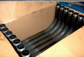
Accessories: special elbows

Tube Fit+ is a revolutionary system exclusively acquired by COOPRA Buis B.V. in order to connect greenhouse tubes waterproof without welding operations or others. The tubes are especially designed for heating installations of greenhouses. The tubes can be fixed by hand and are absolutely watertight.